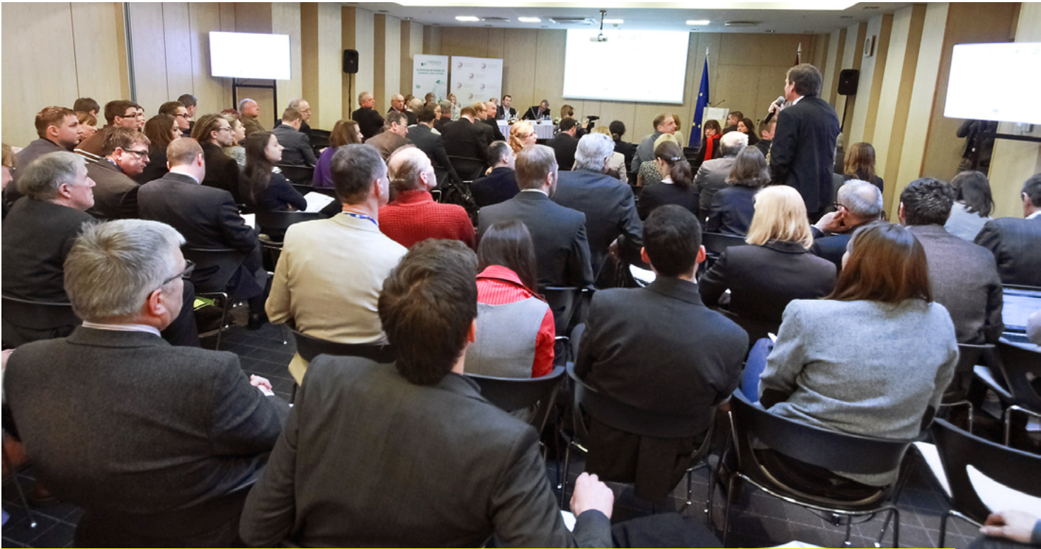
The conference gathered approx. 160 participants.

To avoid sending the wrong signals to Russia, the EU should make clear that it welcomes the outcome of parliamentary elections in Moldova as fair and democratic and should regard outside attempts to destabilise development after the elections as acts of aggression. The EU Presidency should be ready to assist the new government to come to carry out all necessary reforms.